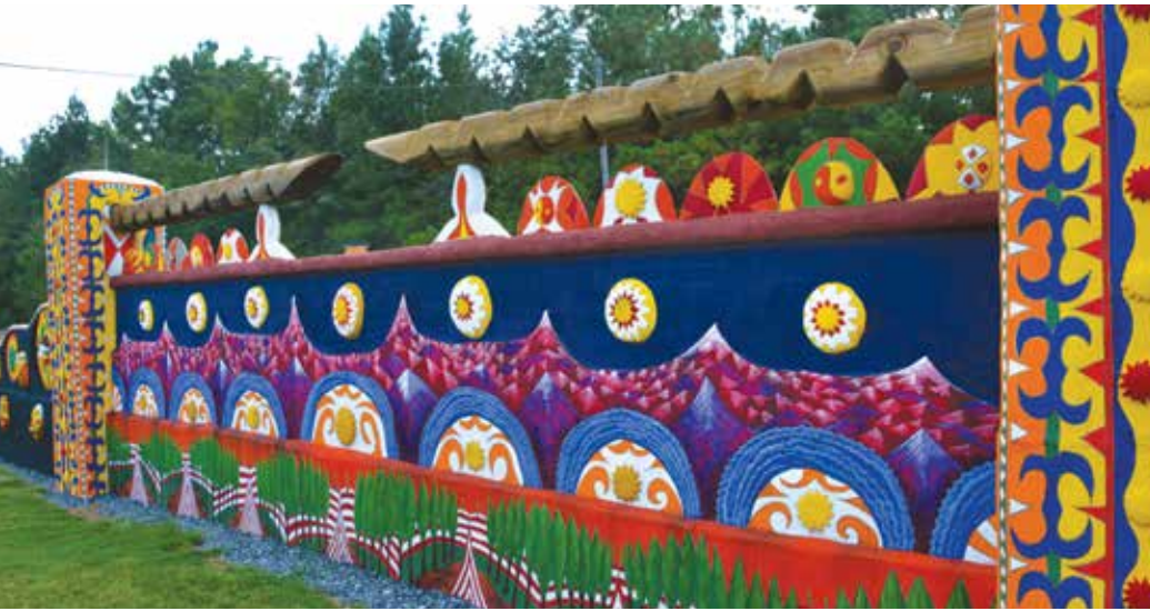
Masonry Wall with Decoration