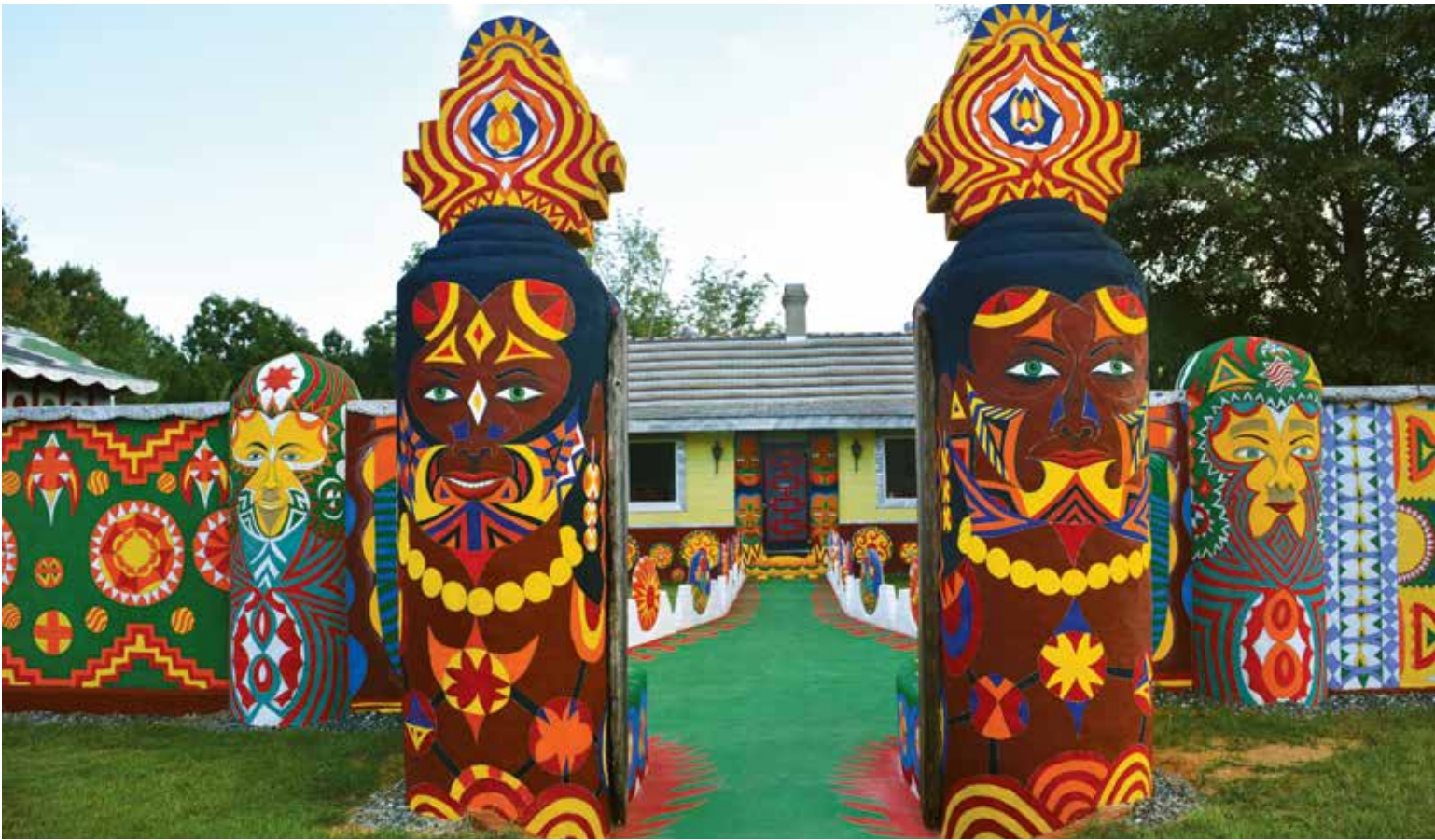
Main Entrance to Pasaquan