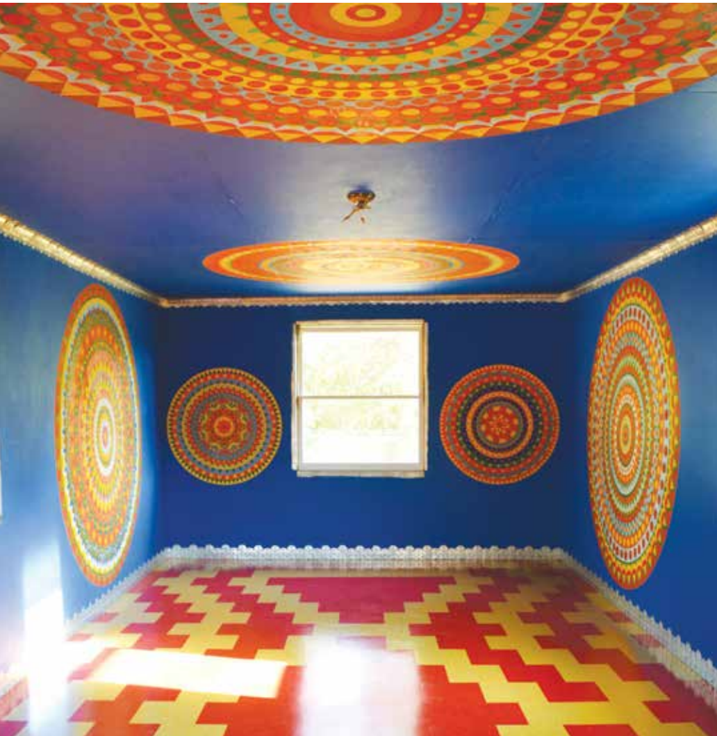
Meditation Room Well House Pagoda