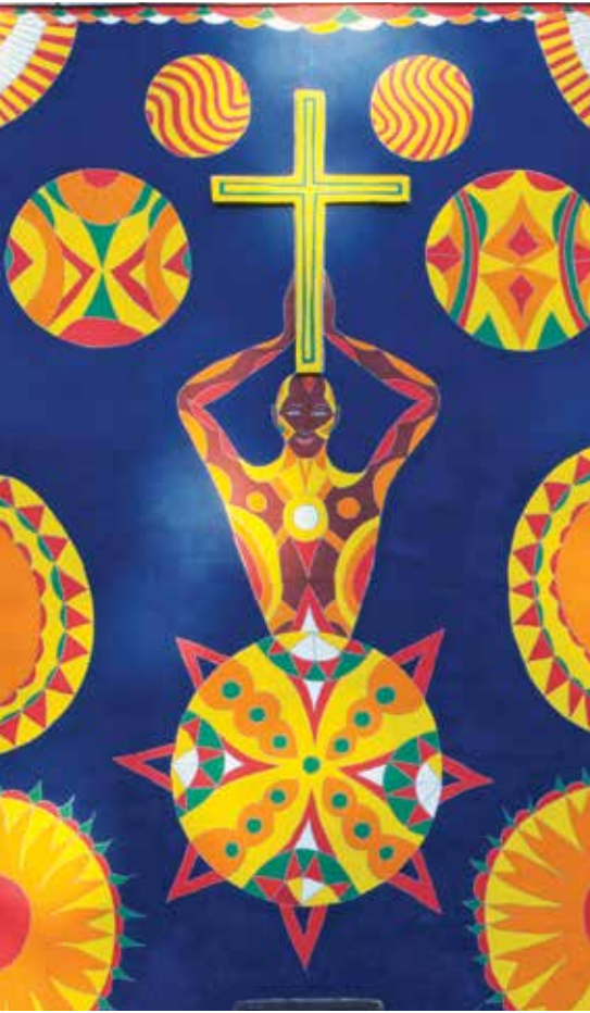
Chimney of Main House with Pasaquayan