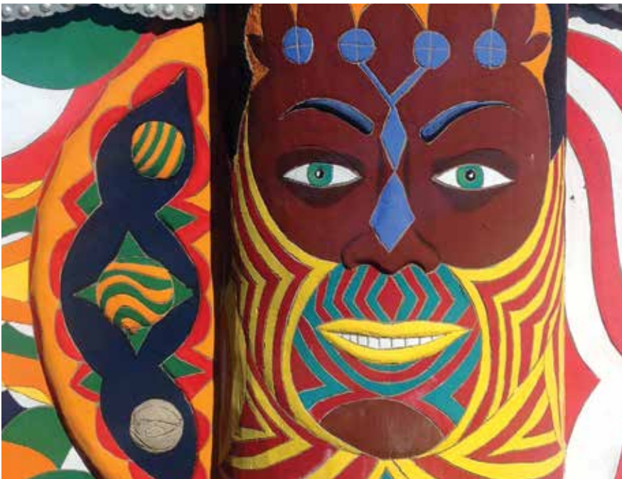
Pasaquayan Totem Front Wall