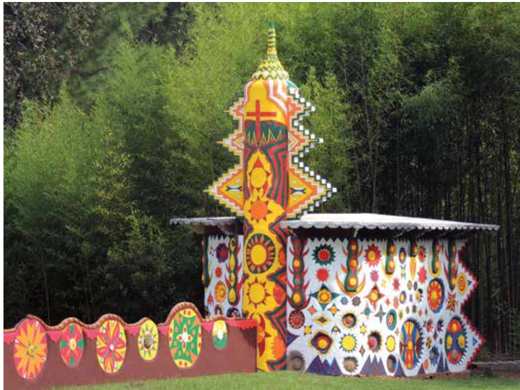
Propane Shed Pagoda – Back of Site