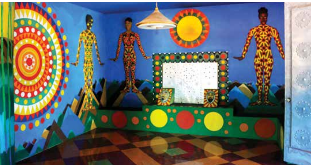
Kitchen with Pasaquayans in Levitation Suits