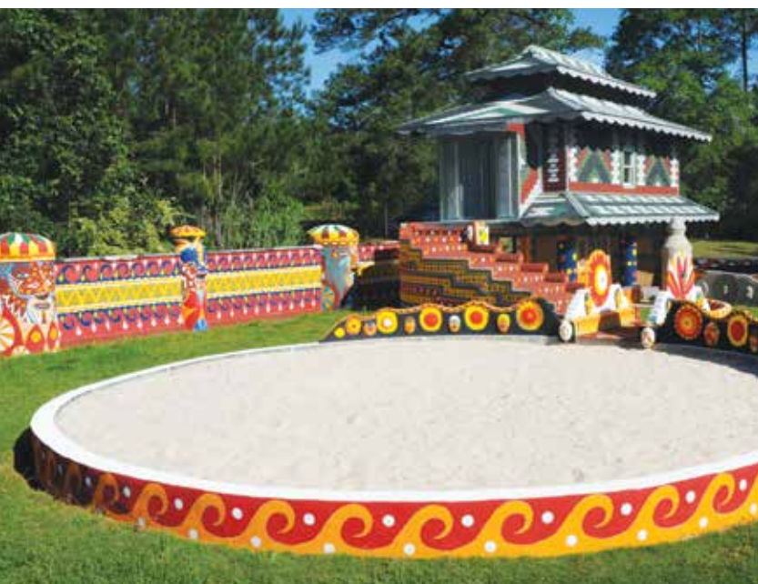
Dance Circle Below Well House Pagoda