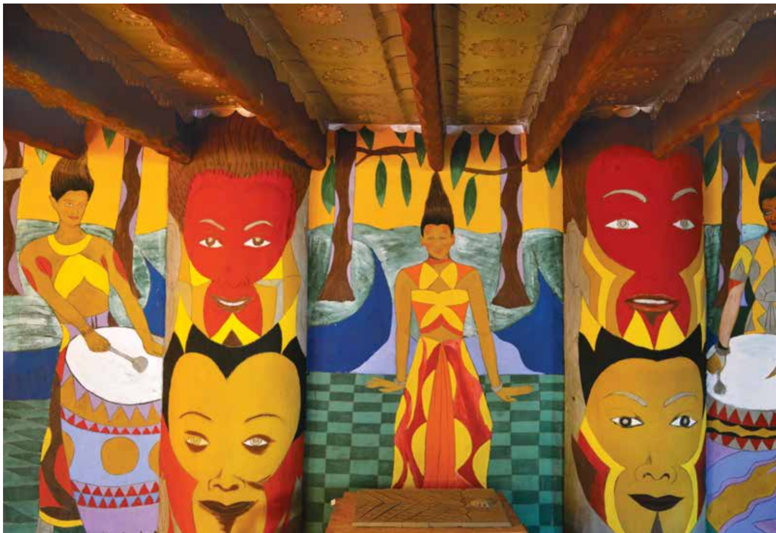
Interior of Oratory Pagoda