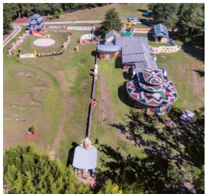
Drone View of Pasaquan