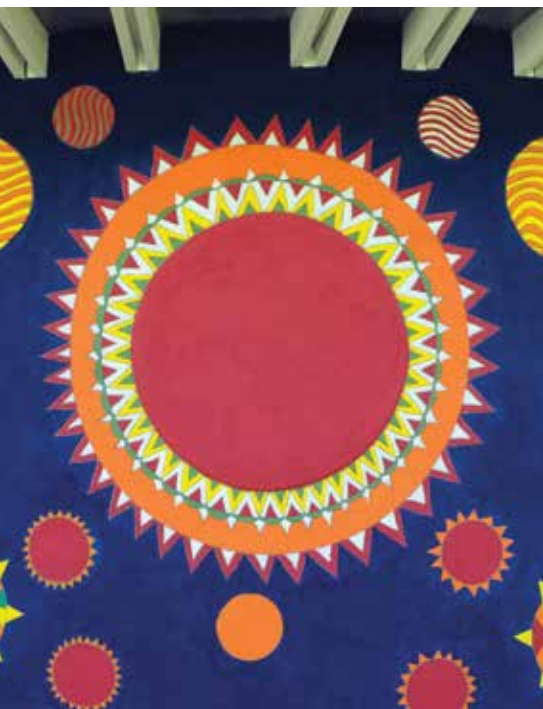
Oratory-Exterior Back Wall