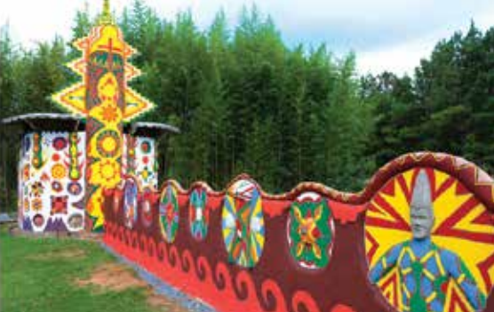
Before and After Restoration